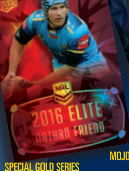
SPECIAL GOLD SERIES