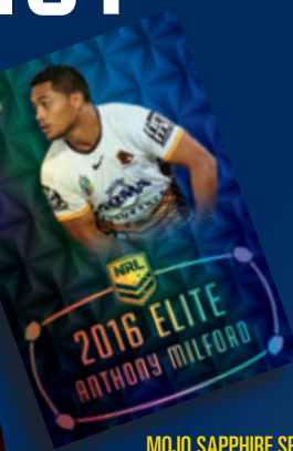
MOJO SAPPHIRE SERIES