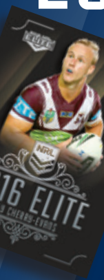
TEAM COMMONS SERIES